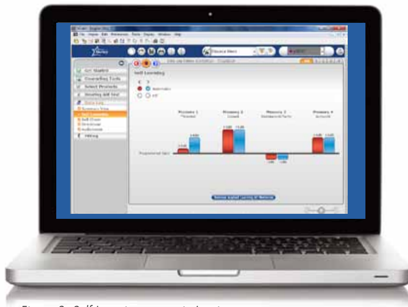
Figure 3: Self Learning screen in Inspire.

Self Learning can be set to either “Off” or “Automatic” on the Self Learning screen. When the feature is set to “Automatic,” learned changes are applied to the instrument and are visible to the clinician the next time the instrument is connected to Inspire. The learned changes can be removed on the Self Learning screen, if desired, returning the Power On gain to the previously programmed level. The ability to remove learned changes is available independently for each Memory Environment.